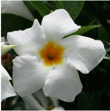
New Tropica™ Medio White