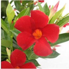
New Tropica™ Medio Red