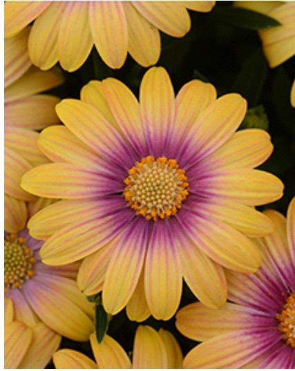
Osteo Blushing Beauty