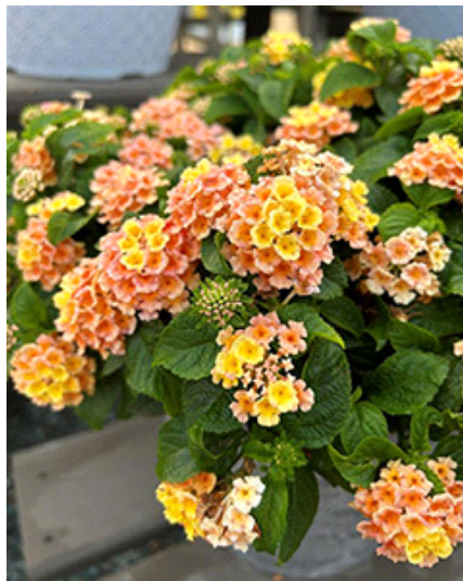
Lantana Little Lucky Peach Glow