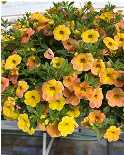
Calibrachoa Cha-Cha Diva Apricot

In keeping with tradition, Ball FloraPlant features the following plant choices for your viewing pleasure ... and program building! May your greenhouse find peace in peachy recalibration in 2024!