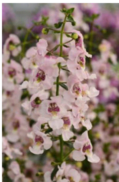
Angelonia Archangel Light Pink

Click Here to Download the full Ball FloraPlant Color Trend Guide (PDF) >>