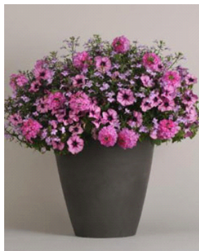
MixMasters Pink Outside the Box