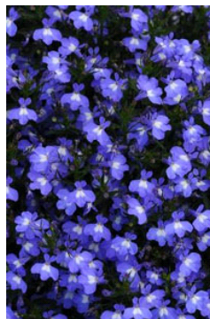
Lobelia Hot Springs Sky Blue