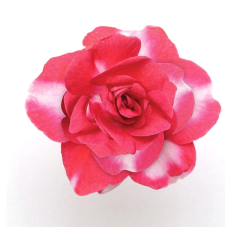
Fiesta™ Sparkler Cherry