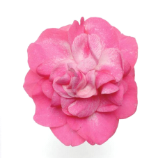
Fiesta™ Stardust Pink