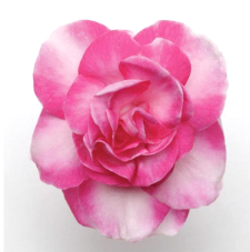
Fiesta™ Sparkler Hot Pink