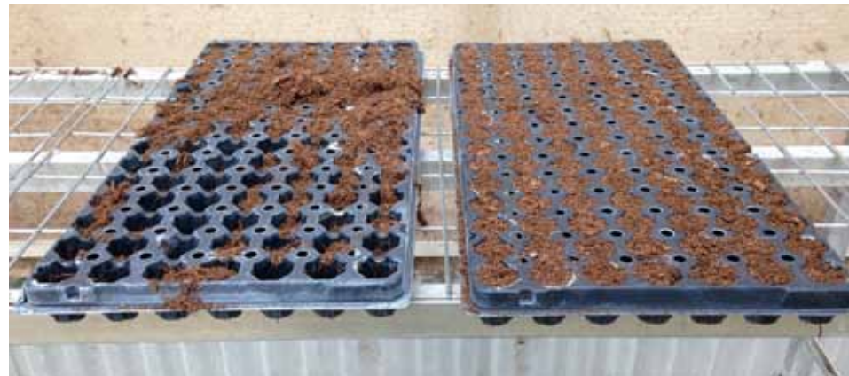
The soil level needs to be uniform in your propagation trays.

The quality of the liner depends on many different things. First, the media—be sure to check pH and EC weekly or biweekly. The pH should be between 5.5 and 6.0 and EC should be between 0.5 and 0.75. You want to ensure uniform filling of the trays and eliminate cells being filled at different levels. Be aware of soil compaction in your trays. If soil is too wet and compact, it can delay rooting time and quality. If you're using media bound with paper, be sure that the paper isn't higher than the plug or it will wick away the water.