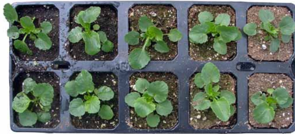
The moisture level scale shown in this tray, with 5 being completely saturated on the left and 1 as extremely dry on the right.